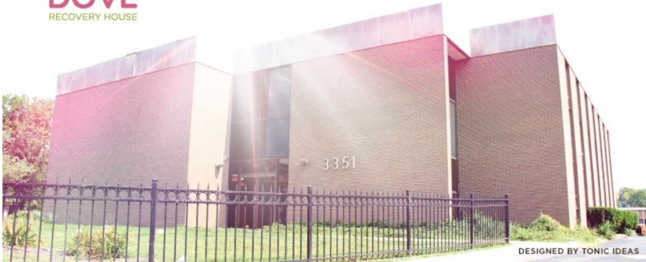
Dove Recovery House for Women

A NEW BEGINNING. A NEW HOME OF HEALING, FAMILY, FAITH AND LOVE.